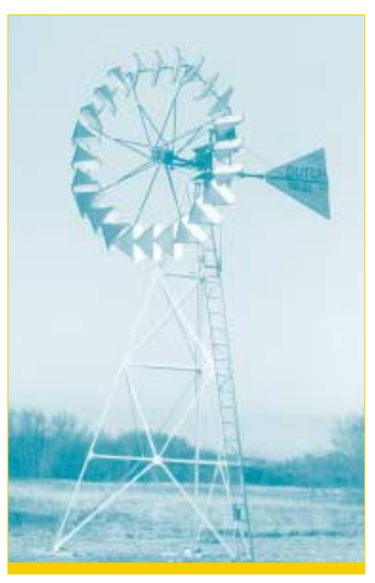
Mechanical water pumping system.